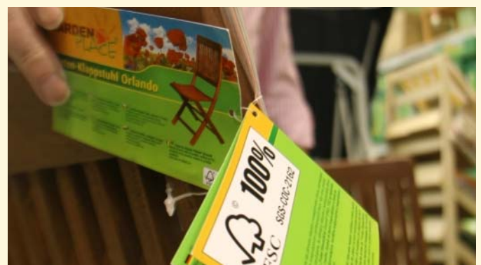
FSC certified garden chair carrying the FSC logo, 2007.