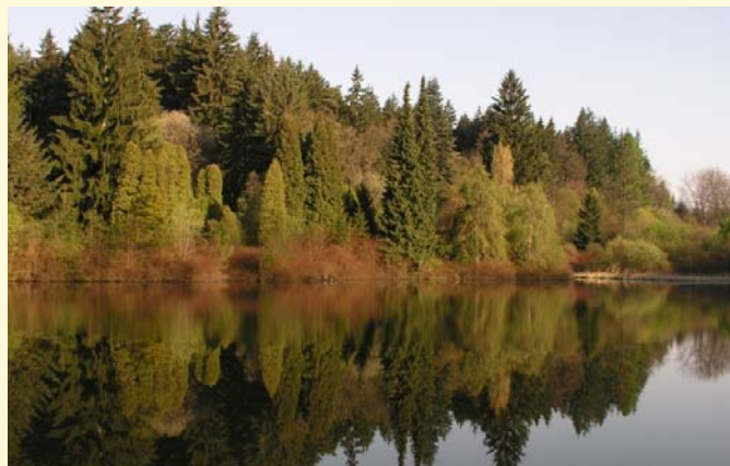
FSC certified Forest, Croatia, 2007. Milan Reska

Another new feature developed in 2007 in FSC's accreditation program is the publication of summaries of ASI surveillance audits. These are available on ASI's website at www.accreditation-services.com , increasing transparency of the accreditation process.