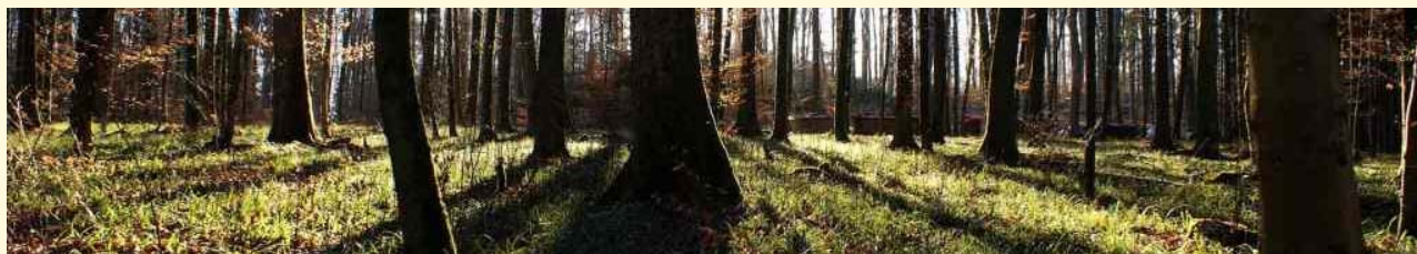
FSC certified forest, Switzerland.

FSC developed two standards to make FSC certification more attractive to small forest owners: the SLIMF (Small and Low Intensity Managed Forests) standard and Group certification. Furthermore, FSC's recently adopted Global Strategy clearly identifies increasing access to FSC certification for small forest owners as an important focus area.