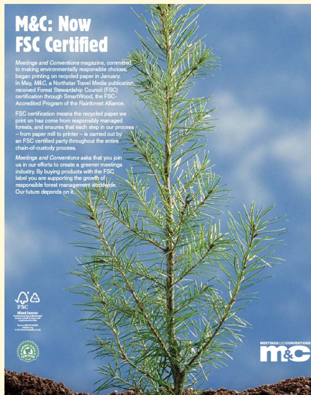
Advertisement of commitment to FSC certification in Meetings and Conventions publication

Based on Northstar Travel Media Press Release 10/05/07