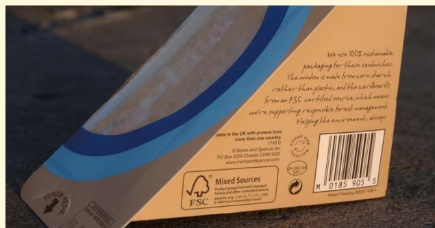
Marks and Spencers FSC certified sandwich packaging

From cardboard used to wrap M&S sandwiches to timber used to build its stores, M&S are exclusively requesting FSC or recycled materials. To achieve this goal, the company is working with its suppliers to move towards more sustainably sourced materials as quickly as possible.