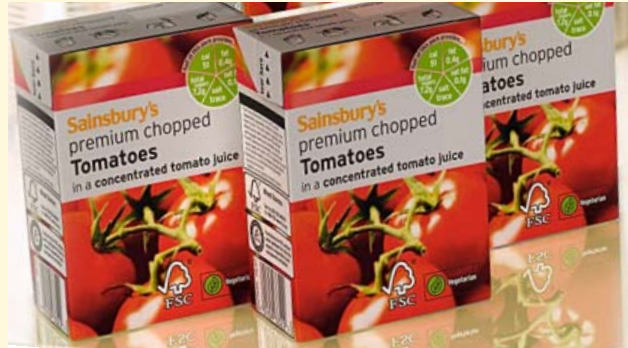
World's first FSC labeled food and liquid carton, Tetra Recart

Tetra Pak has launched the first FSC labelled food and liquid carton. The carton is called Tetra Recart™. The FSC logo printed on it guarantees consumers that the packaging material comes from responsibly managed forests and controlled sources. Sainsbury's, a UK supermarket chain, is the first to use these cartons for its own-label premium chopped tomatoes.