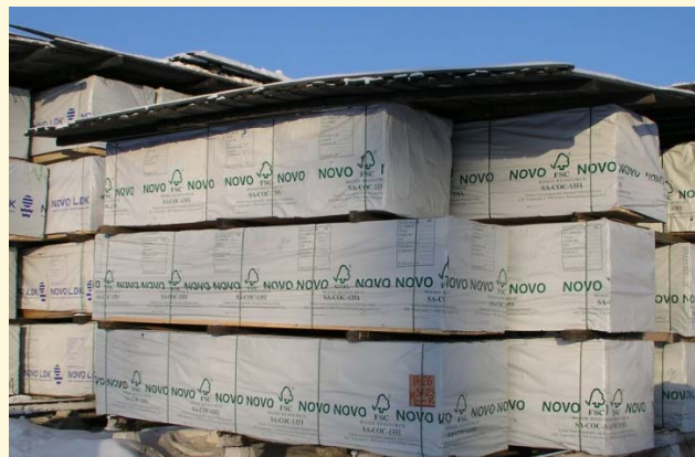
FSC certified stock, Russia

Stretching from the Baltic Sea to the Pacific Ocean, Russia holds 22% of the world's forest area. Every year more of this area is certified to FSC standards. Three of the top ten largest FSC certificates and nearly one-fifth (18%) of all of FSC certified forest area lie in Russia. The first FSC certificate in Russia was issued only seven years ago. The FSC Russia office opened in 2005.