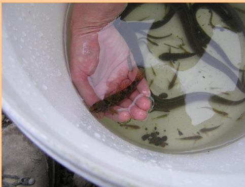
Native fish captured in demonstration of aquatic life in small plantation stream during “Dirtshop”.

The 2009 – 2010 year saw a specific effort on training both staff and Contractor Principals on our engineering standards required to minimise risks of sediment and erosion releases from roading operations.